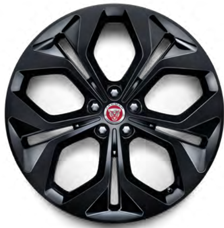
21" Style 5053, 5 split-spoke, Gloss Black