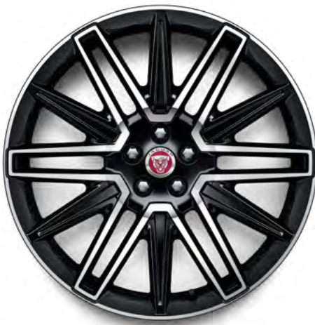
21" Style 1078, 12 split-spoke, Gloss Black Diamond Turned finish