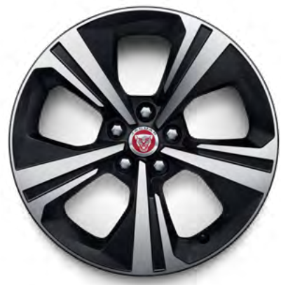
18" Style 5118, 5 spoke, Satin Black Diamond Turned finish