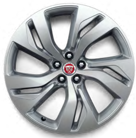
20" Style 5120, 5 spoke, Chrome Shadow