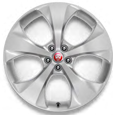
20" Style 5054, 5 spoke, Gloss Sparkle Silver

Personalise your vehicle with a selection of alloy wheels featuring a wide range of contemporary and dynamic designs.