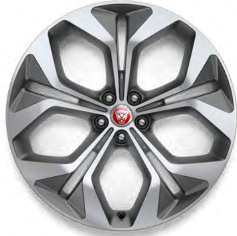
21" Style 5053, 5 split-spoke, Satin Grey Diamond Turned finish