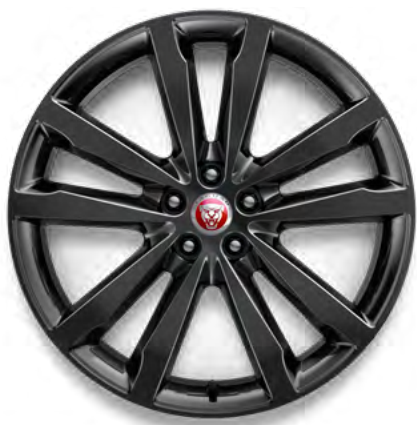
20" Style 5051, 5 split-spoke, Gloss Black