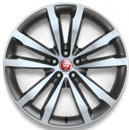
20" Style 5051, 5 split-spoke, Satin Grey Diamond Turned finish