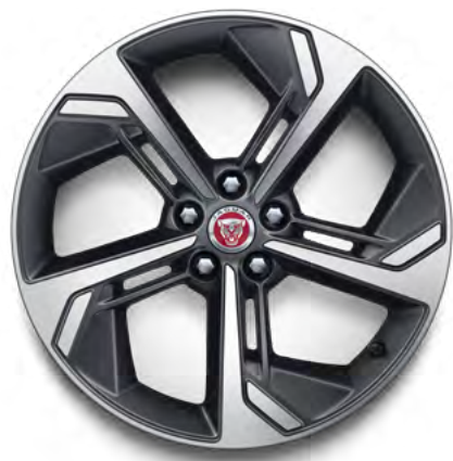
19" Style 5119, 5 spoke, Satin Dark Grey Diamond Turned finish