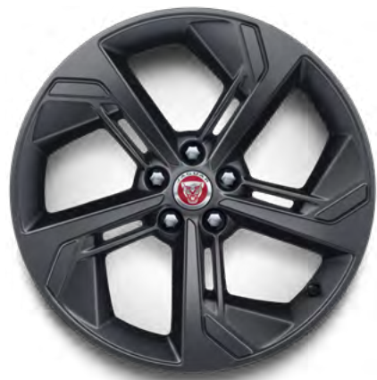
19" Style 5119, 5 spoke, Satin Dark Grey