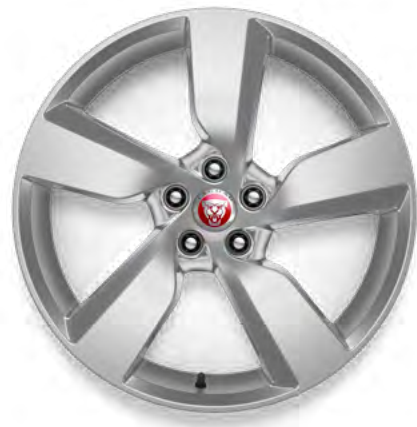
19" Style 5049, 5 spoke, Gloss Sparkle Silver