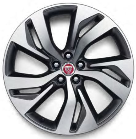
20" Style 5120, 5 spoke, Satin Grey Diamond Turned finish