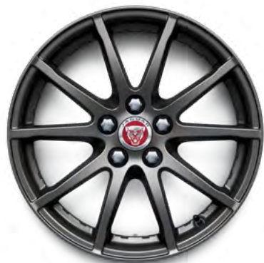
17" Style 1005, 10 spoke, Satin Dark Grey

Personalise your vehicle with a selection of alloy wheels featuring a wide range of contemporary and dynamic designs.