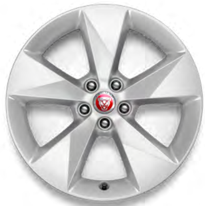
18" Style 5048, 5 spoke, Gloss Sparkle Silver