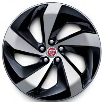
19” Style 5103, 5 spoke, Gloss Black with contrast Diamond Turned finish