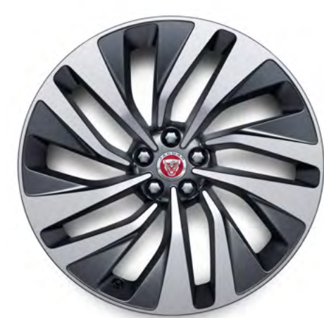
21" Style 1068, 10 spoke, Satin Dark Grey with contrast Diamond Turned finish

Personalise your vehicle with a selection of alloy wheels featuring a wide range of contemporary and dynamic designs.