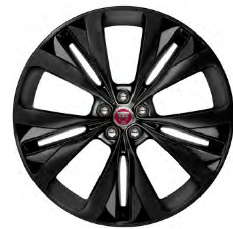
22" Style 1020, 15 spoke, Gloss Black with Satin Black inserts