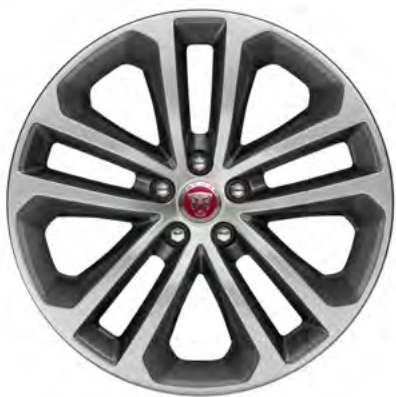
19” Style 5038, 5 split-spoke, Gloss Grey with contrast Diamond Turned finish