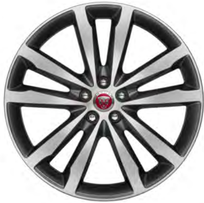
20” Style 5031, 5 split-spoke, Gloss Grey with contrast Diamond Turned finish