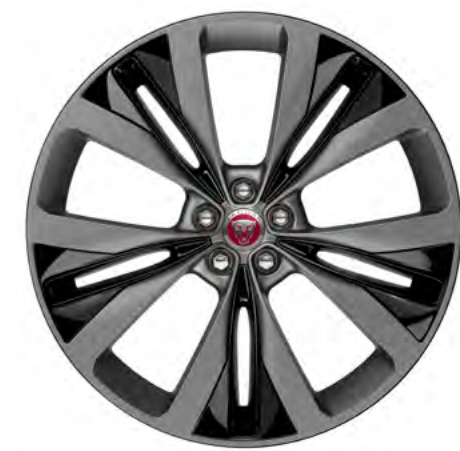
22" Style 1020, 15 spoke, Gloss Grey with contrast inserts