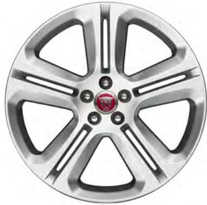
20” Style 5036, 5 split-spoke, Gloss Sparkle Silver