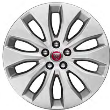
18” Style 1021, 10 spoke, Gloss Sparkle Silver

Personalise your vehicle with a selection of alloy wheels featuring a wide range of contemporary and dynamic designs.