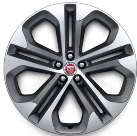
21” Style 5104, 5 split-spoke, Satin Dark Grey with contrast Diamond Turned finish