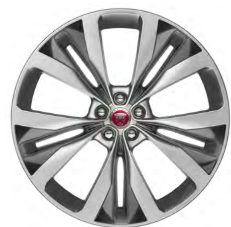
22" Style 1020, 15 spoke, Gloss Silver with contrast inserts