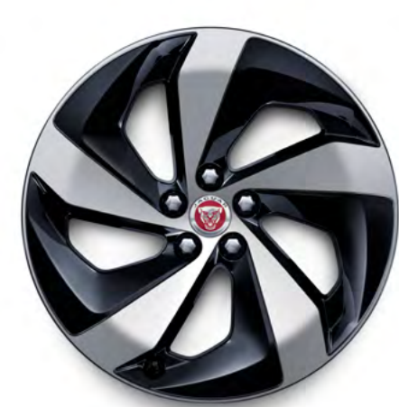
21" Style 7024, 7 spoke, Gloss Black Diamond Turned finish