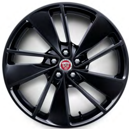
20” Style 1067, 10 spoke, Gloss Black