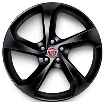
19” Style 5037, 5 spoke, Gloss Black